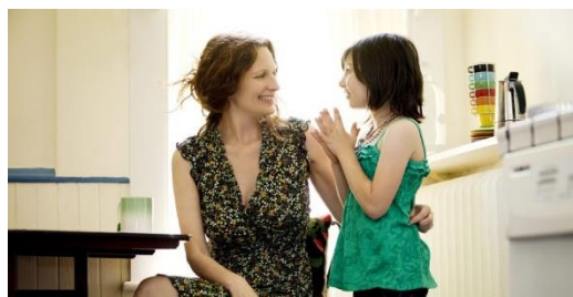
Mother and daughter talking in kitchen

http://www.stammering.org/help-information/parents/under-5s/bsa-leaflets-parents-under-5s/stammering-and-bilingual-child